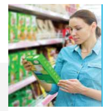
If you have diabetes, it is with a dietitian to get personalized tips and learn how to read food labels and count carbohydrates.

Alcohol also affects your blood glucose levels. If you drink alcohol, it is recommended that you not do so on an empty stomach, that you do not drink every day, and that you limit your alcohol intake to the amount agreed on with your doctor or another member of your healthcare team.